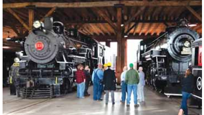
Berths in the roundhouse have restored engines and locomotives, along with an area dedicated to repair and reconstruction.

Contact: FARM SHOW Followup, Age of Steam Roundhouse, 213 Smokey Lane Rd. S.W., Sugarcreek, Ohio 44681 (ph 330-852-4676; info@ageofsteamroundhouse.org; www.ageofsteamroundhouse.org).