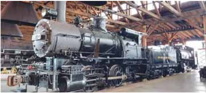
Museum owns 25 steam engines and freight equipment, including boxcars, flatcars, oil tankers and hopper cars.